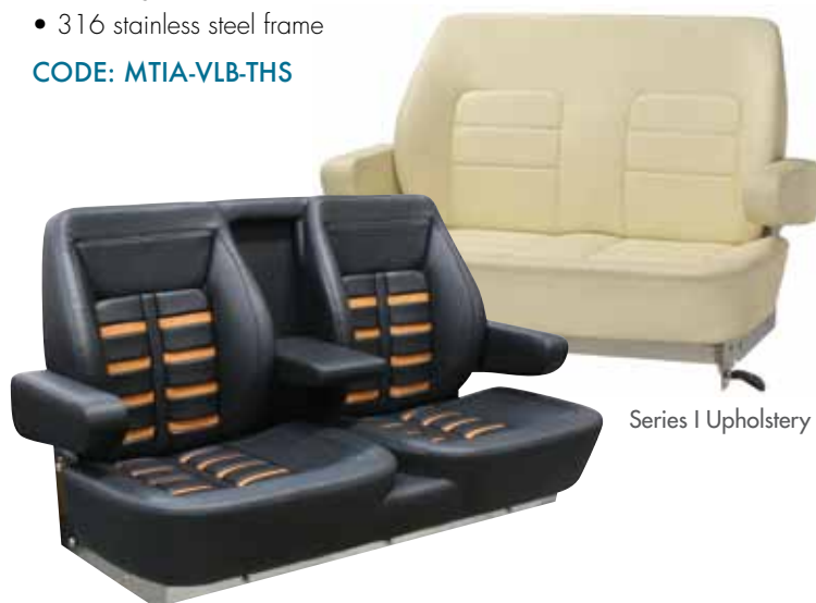
Series I Upholstery