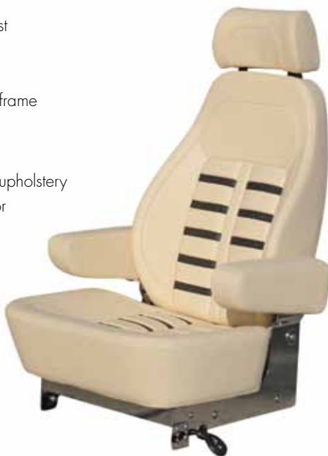
Series II Upholstery