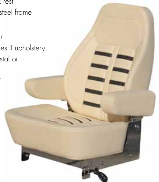
Series II Upholstery