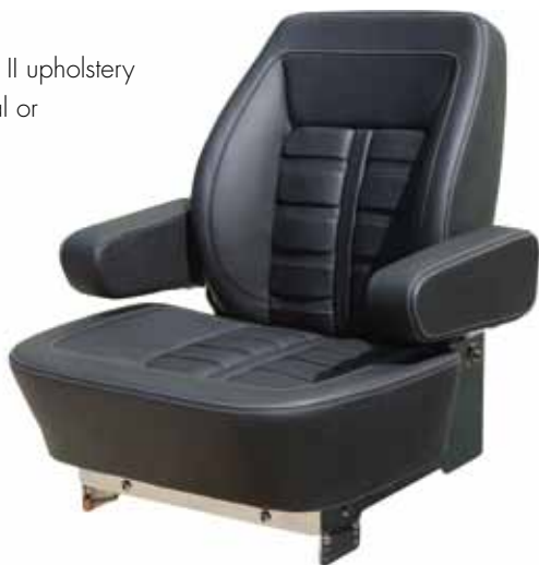
Series II Upholstery